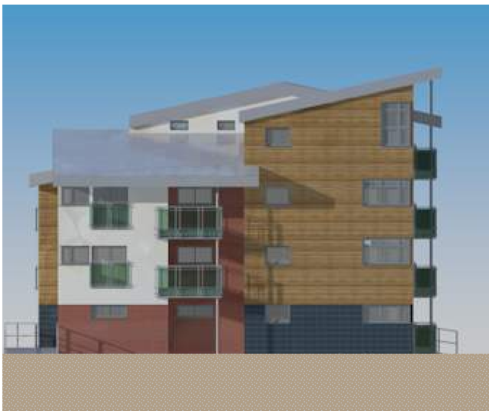
Oak & Cedar Villas - Proposed West Elevation