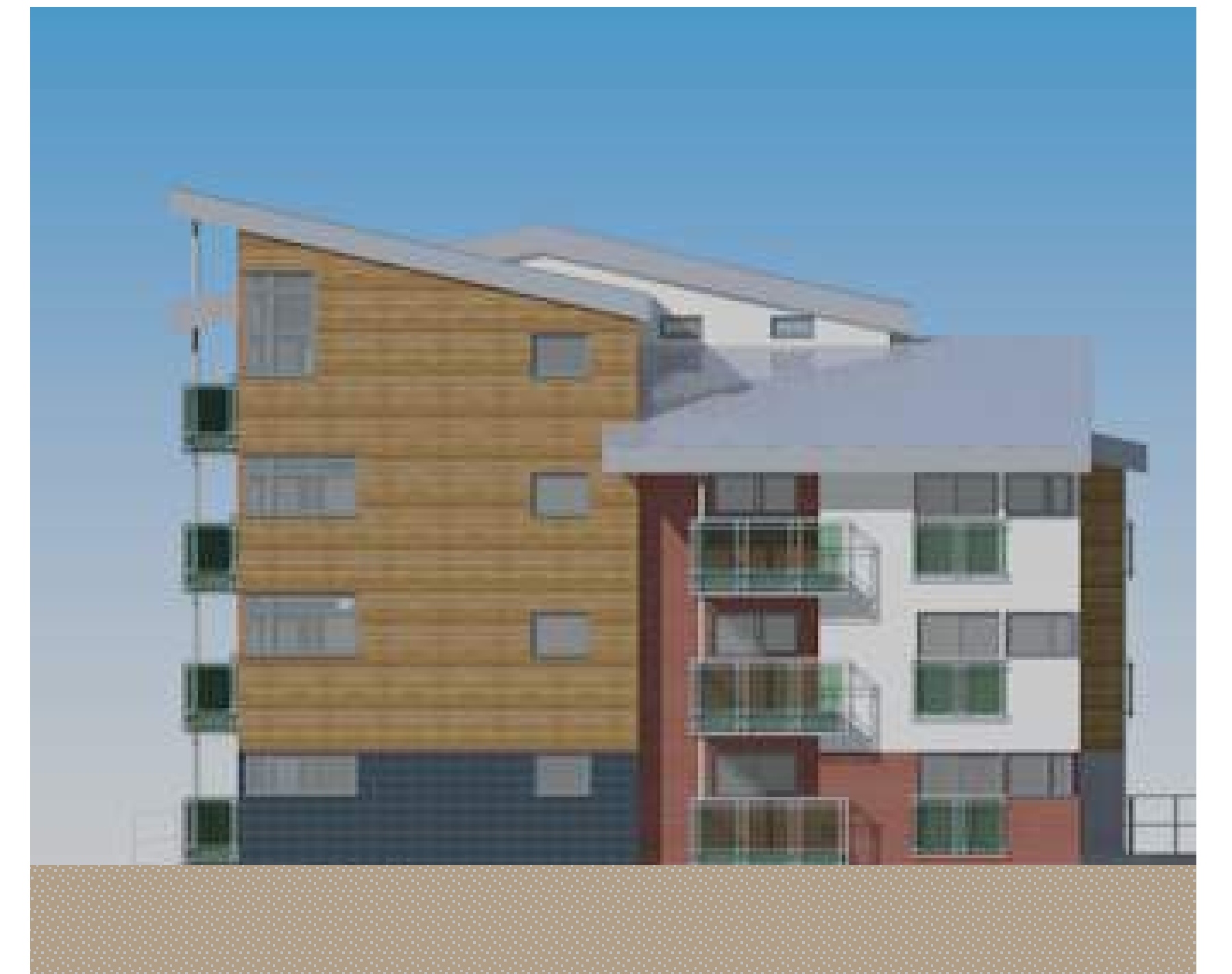
Oak & Cedar Villas - Proposed East Elevation

The relationship to Montacute school is a key consideration. Storey heights have been reduced where the proposals bound with the school and balconies have been located to prevent overlooking.