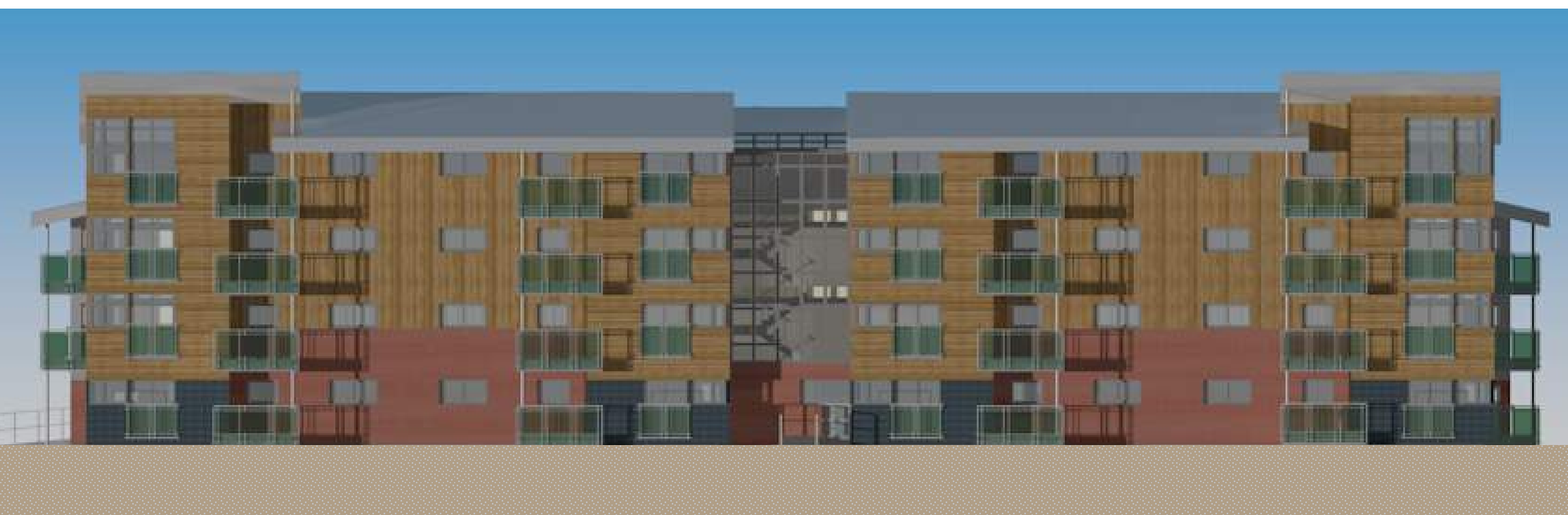
Oak & Cedar Villas - Proposed South Elevation