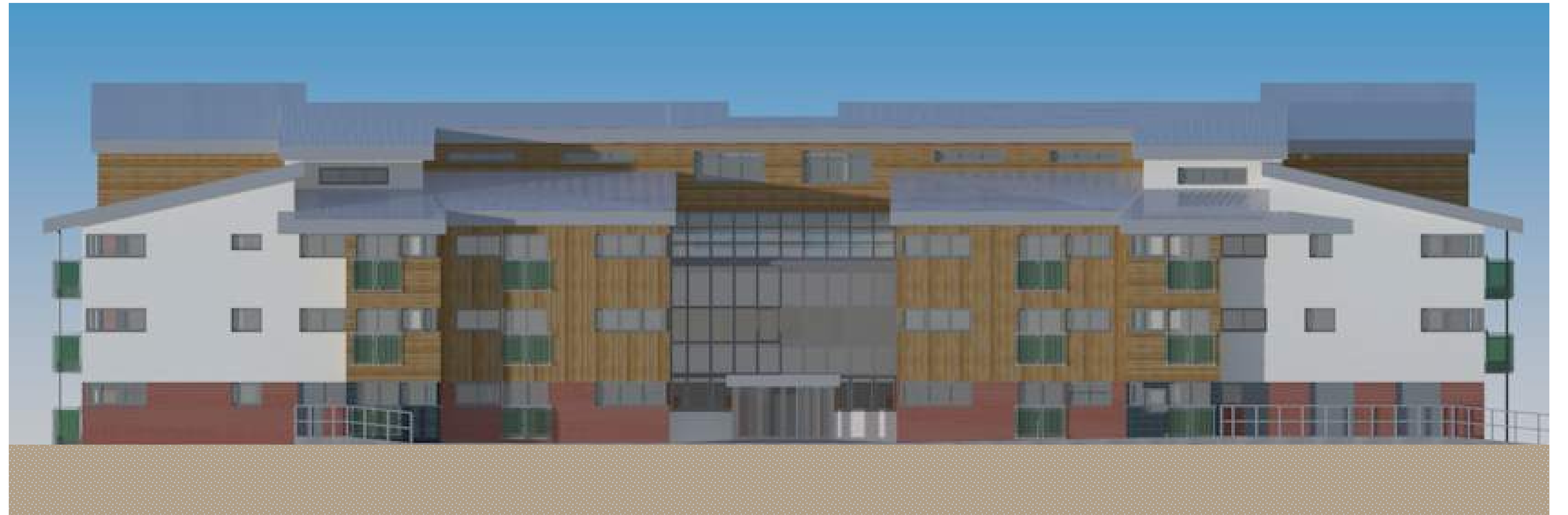
Oak & Cedar Villas - Proposed North Elevation

The visual character of the buildings have been designed to create a distinctive appearance whilst sitting comfortably within its surroundings. Variation in storey heights, fenestration detail and material usage promotes interest and articulation to reinforce the strong sense of place created within the scheme.