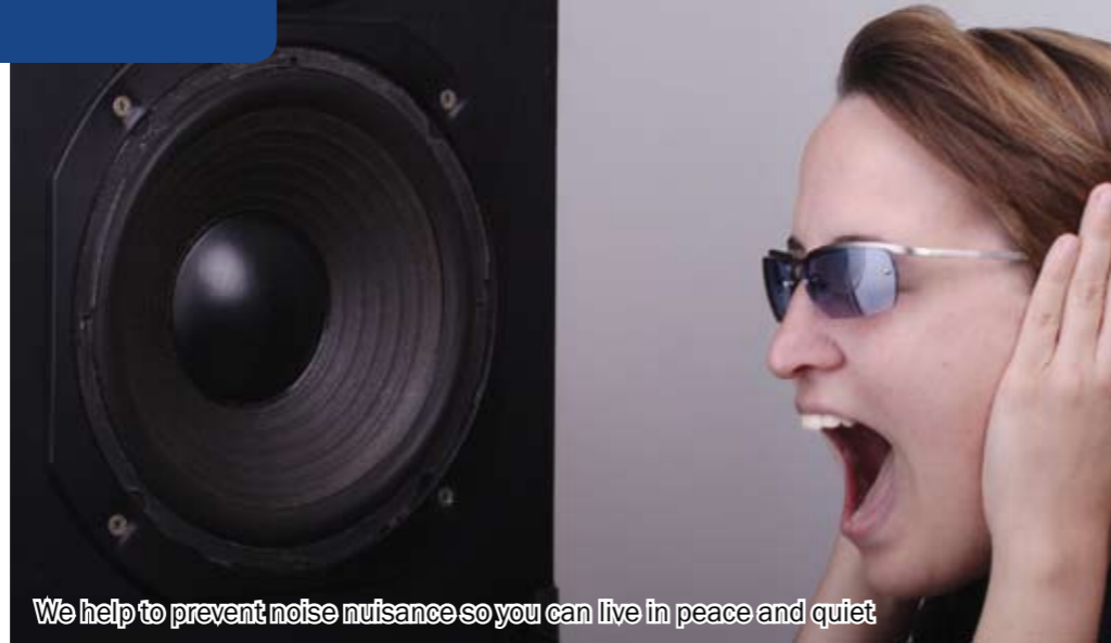
We help to prevent noise nuisance so you can live in peace and quiet

Don't Make Me Angry! Find out what the BIG issues REALLY are in Poole