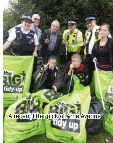
A recent litter pick at Arne Avenue

Young people who are involved with the Rossmore Personalised Learning Centre have helped by taking part in a neighbourhood clean-up campaign.